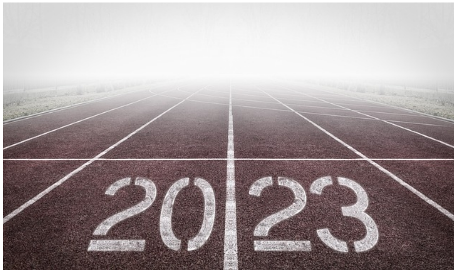
TCCR Social Media Screenshot