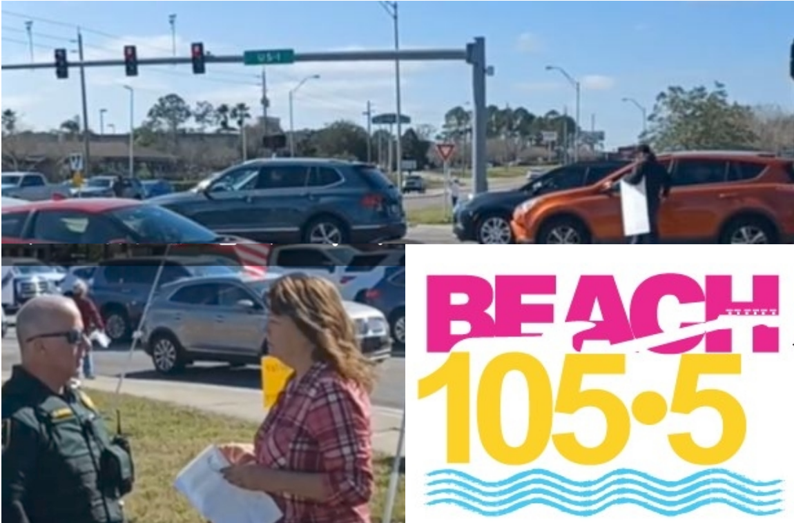
SATP Staff Screenshots