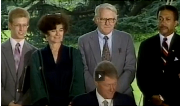
TCCR Social Media Screenshot