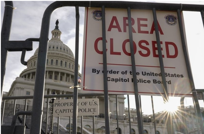
TCCR Staff Screenshot

The fact that there are even political prisoners existing in America reveals the degree and depth of our tyrannical government in Washington DC.