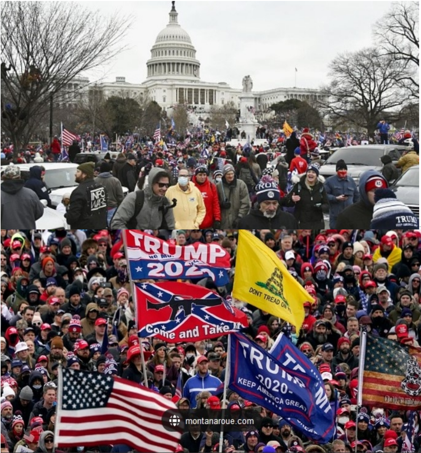
FB Images Washington DC January 6, 2021

God bless and strengthen those who are giving so much in the defense of Liberty!