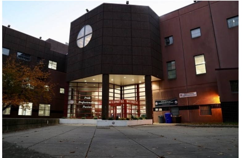
DC Jail

Amid reports from various sources, J 6 detainees report abuses while they are forced to await their trials—no speedy trials; no ability to post bond; and in some cases no legal representation. The J 6 prisoners claim they are not provided with attorneys, are not cared for medically and are provided poor food, forcing them to rely on food brought in by friends and relatives or food purchased at the Jail Commissary in the DC Jail. In addition the facilities are filthy and often reek of offensive odors. Recreational time for J 6 prisoners is greatly restricted as compared to other prisoners in the Correctional Detention Facility. Detainees report physical and sexual abuse by guards and a program of Communist indoctrination, such as white supremacy doctrine being forced on them.